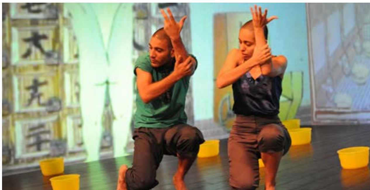
From: Furo by Ohad Naharin

"This is a multidisciplinary and interdisciplinary space designed to meet the dynamic needs of global and local contemporary art processes. The versatility of the space enables a format open to definition by creators and audiences alike, as well as an infinitely wide range of exchange and engagement. In its modular architectural features, the space reflects a contemporary flexibility in method and discipline, and invites creators from different fields to interpret it in their own unique way."