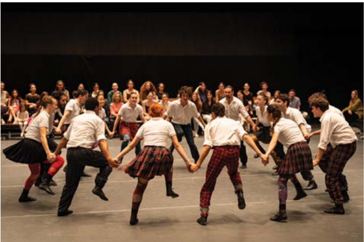
From Kamuyot by Ohad Naharin, Performed by The Batsheva Ensemble.

Special emphasis will be placed on a public program aimed at bringing the general public closer to the art of dance and to the arts in general, through artist talks, open rehearsals, studio visits, lectures and classes.